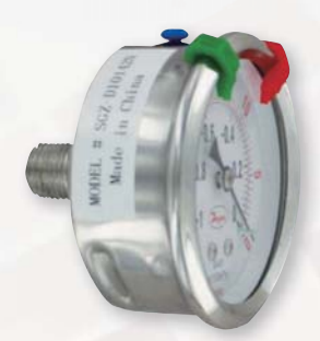
SGZ back with accessory pointers