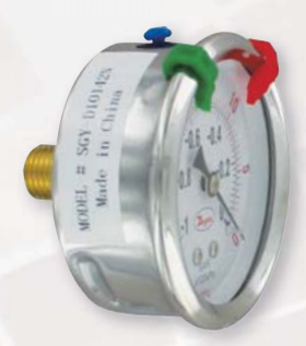
SGY back with accessory pointers