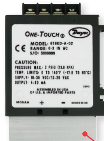
Optional NPT connection block